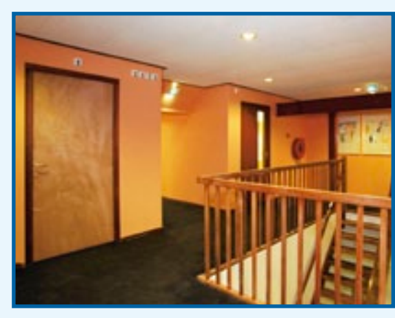
Concealed detachable FR19VO ceiling.

Thanks to the FAAY fixing system, assembly takes place in no time at all. Simple, ingenious and labour efficient! Once the special side planks have been applied, assembly only involves sliding panels and bactions into place.