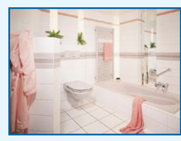
Application in bathrooms.

Besides the nail and screwbearing type of wall VP35, which has been around for years, FAAY offers the type GP22 as an alternative for situations where one must save on space or weight. Both wall types are very suitable for renovation projects, and projects where the sound insulation of existing (wall) constructions must be improved. To improve the thermal