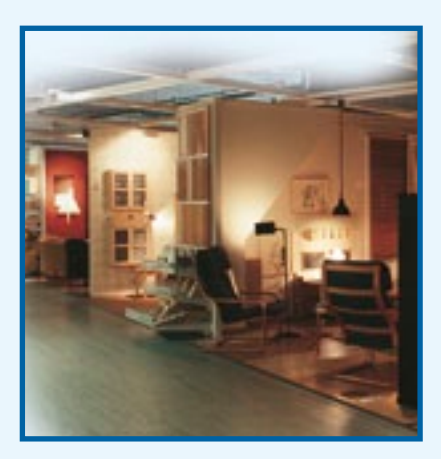
Application in showrooms.

You can count on various forms of professional advice from Faay Vianen B.V. A good example of this is the opportunity to have your plans specified by our calculation department, where materials are selected and a pre-calculation is made. This offers you a complete list of materials, which is specified per component and which contains recommended retail prices. If necessary, these specifications can be supported by technical drawings. Our Rayon Manager is available to jointly discuss the drawings with you. Personal attention is something which Faay Vianen B.V. values dearly.