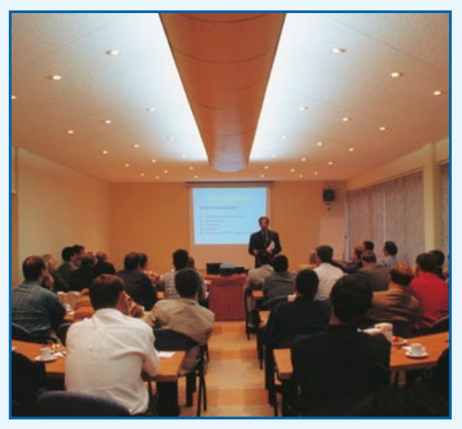
At the info centre the architect and contractor can be "educated".

All FAAY wall and ceiling systems are deliverable from stock and can be placed quickly. This means a considerable saving on your mounting expenses.