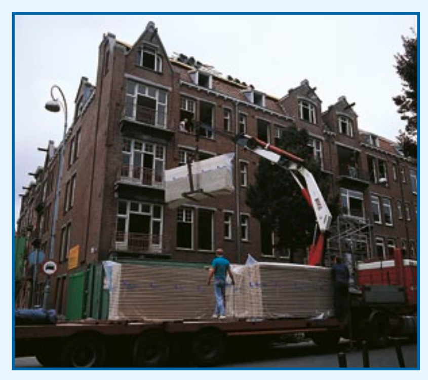
Delivery at floor level.