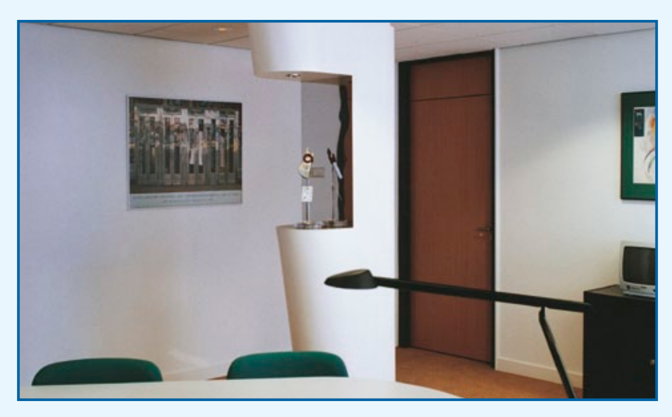
FAAY partitions applied in management office; high insulation value.

insulation on the inside of a building, Faay has the W'all-in-One retention wall (PG50, PG60, PG70, PG90 and the self-supporting variant) available to improve the thermal insulation on the inside of a building.